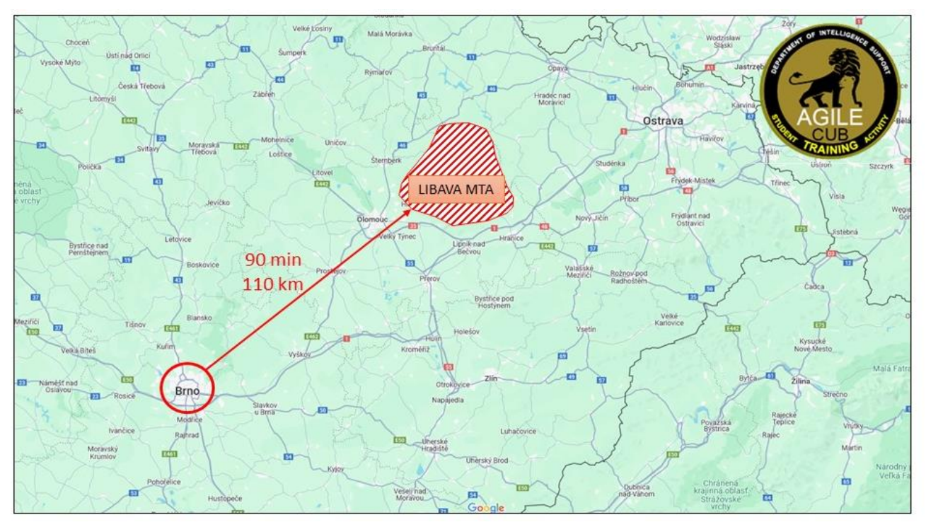
Map 2 – Distance and travel time from Brno to Libava MTA